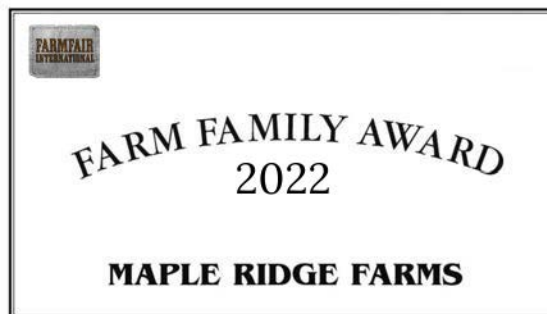
Example Gate Sign: FARM NAME

PLEASE PRINT GATE SIGN NAME AS IT WILL APPEAR ON THE SIGN: